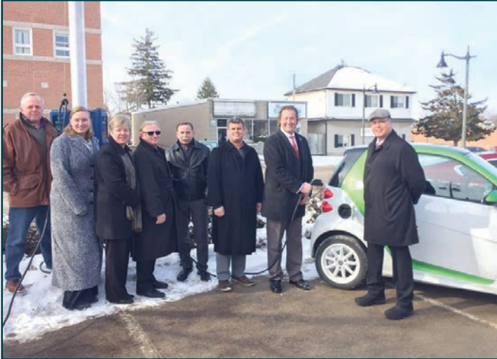
Electric vehicle charging station, Ingersoll